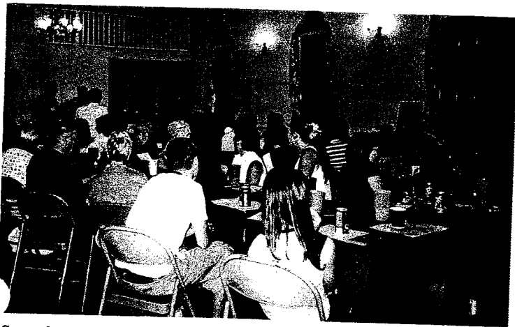
Saturday night dinner at the Dade City Garden Club. Hard to tell whether the talking or the eating was primary, but the setting was conducive to both!