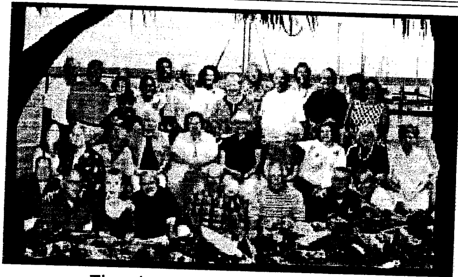
Thrasher Family Association 2008 Reunion Kingsland, Georgia