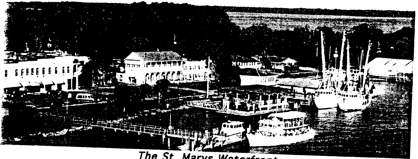
The St. Marys Waterfront